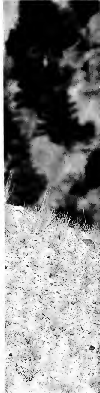
Elk: Conrad Rowe